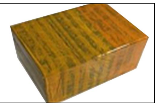
Pic No. 3 International express packaging: Wrapped with yellow tape after wrapping black protective film