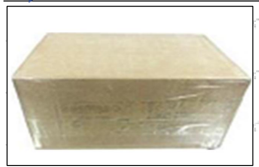
Pic No. 2 Domestic express packaging: Wrapped with Transparent tape